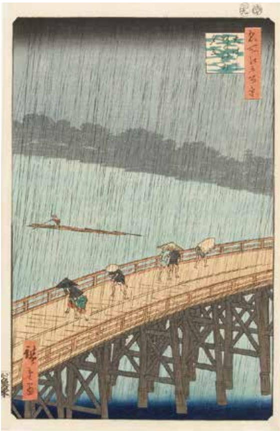
Work exhibited in Part1. Utagawa Hiroshige One Hundred Famous Views of Edo "Sudden Shower over Shin-Ohashi Bridge and Atake" Collection of Shizuoka City Tokaido Hiroshige Museum of Art

Van Gogh, artist from the Netherlands and famous for works, "Les Tournesols" and "Terrasse du café le soir" is known to be an avid collector of Ukiyo-e. He has also created Ukiyo-e imitation pieces by the name of Japonaiserie (Japan-taste). This includes the "Sudden Shower over Shin-Ohashi Bridge and Atake" that allows the viewer to feel the sound through countless lines of ink that express pounding rain and movement through images of people rushing on the bridge to avoid the sudden shower, as well as "Plum Garden in Kameido" that exaggerates the size of the foreground with perspective representation and known for the distinct contrast of red and green. We hope you enjoy "One Hundred Famous Views of Edo" that melted the heart of Van Gogh.