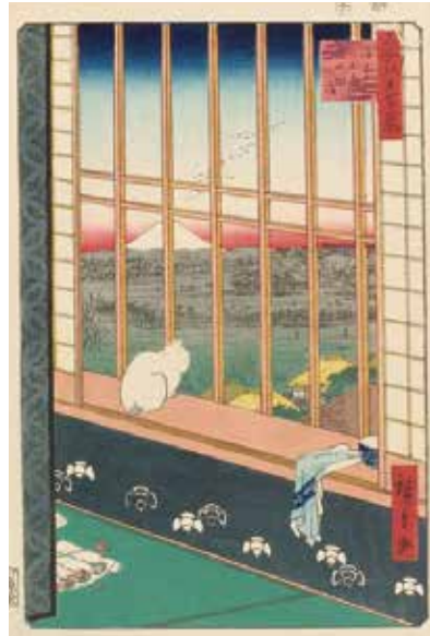
Work exhibited in Part1. Utagawa Hiroshige One Hundred Famous Views of Edo "Asakusa Ricefield and Torinomachi Festival" Collection of Shizuoka City Tokaido Hiroshige Museum of Art