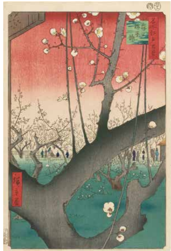
Work exhibited in Part2. Utagawa Hiroshige One Hundred Famous Views of Edo "Plum Garden in Kameido" Collection of Shizuoka City Tokaido Hiroshige Museum of Art