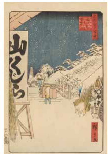
Work exhibited in Part2. Utagawa Hiroshige One Hundred Famous Views of Edo "Bikunihashi Bridge in the Snow" Collection of Shizuoka City Tokaido Hiroshige Museum of Art