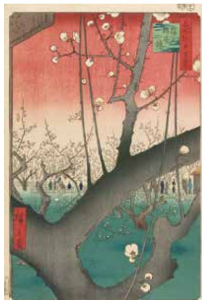
Work exhibited in Part2. Utagawa Hiroshige One Hundred Famous Views of Edo "Plum Garden in Kameido" Collection of Shizuoka City Tokaido Hiroshige Museum of Art