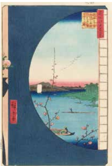
Work exhibited in Part2. Utagawa Hiroshige One Hundred Famous Views of Edo "View from Massaki of Sujin Shrine, Uchigawa Inlet and Sekiya" Collection of Shizuoka City Tokaido Hiroshige Museum of Art