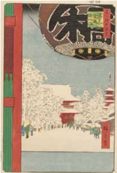
Work exhibited in Part1. Utagawa Hiroshige One Hundred Famous Views of Edo "Kinryūzan Temple in Asakusa" Collection of Shizuoka City Tokaido Hiroshige Museum of Art

"One Hundred Famous Views of Edo" by the Master Landscape Artist Utagawa Hiroshige was made in the artist's last years and is noted for the frequent use of extremely enlarged foreground objects to create depth. Published in succession from 1856, 100 pieces were planned just as the title suggests. But it proved so popular that all 100 were made within a year of it first being released so more were published afterwards. There are 118 pieces in existence which bears Hiroshige's name and is the largest number of works made by a single artist in a Ukiyo-e series. In total there are 120 works including the piece "Paulownia Trees at Akasaka in the Evening Rain" by Utagawa Hiroshige II and the table of contents designed by Baisotei Gengyo. This exhibition displays approximately 107 of the 120 pieces in the series.