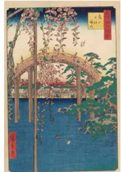
Work exhibited in Part1. Utagawa Hiroshige One Hundred Famous Views of Edo "Inside Kameido Tenjin Shrine" Collection of Shizuoka City Tokaido Hiroshige Museum of Art